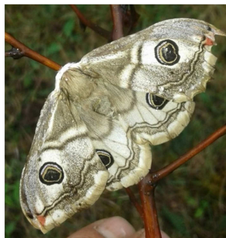
Figure 2. Female of Saturnia pavonia L.

This is the first and only discovery of this moth's species in North Ossetia.